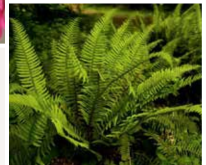
Western Sword fern

Consider using native plants in your landscape. The perfect equation for the environment is also the perfect equation for your landscape!