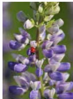
Lady bug and Large leafed Lupine

As more people use native plants in their urban landscaping the available habitat for wildlife increases and benefits the community as a whole. No harsh chemicals or invasive behaviors. Going native helps save our natural heritage for future generations.