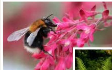
Native honeybee on a Ribes Sanguinum blossom